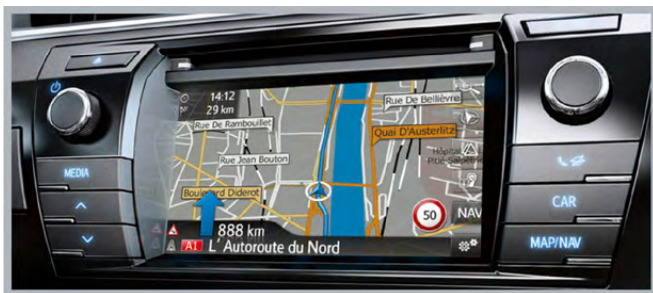
ForgeRock Access Management provides secure, personal access to the Toyota Touch 2 with Go device. Built into the vehicle’s dashboard, the device provides information, entertainment, enhanced navigation, and connected services.

ForgeRock’s Access Management is an all-in-one solution that includes authentication, SSO, authorization, federation, entitlements, adaptive authentication, strong authentication, and web services security in a single, unified product. With its comprehensive features, ForgeRock Access Management met the rigorous requirements of the Toyota team. Unlike most other access management products, ForgeRock Access Management was designed from inception to provide services for the web, cloud, mobile devices, and even “things” like cars. With a common programming interface (REST) and extensive standards support, it is easy for the Toyota development team to install and scale out the ForgeRock Access Management solution. The Toyota development team also appreciates how rapidly ForgeRock develops important new functionality and features—always ensuring the team is using the latest in identity relationship management technology.